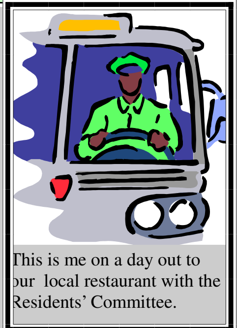
This is me on a day out to our local restaurant with the Residents’ Committee.

“I also assist with events that are organised in the Tansy Centre, such as coffee mornings, bingo evenings, and Saturday night social evening and any other volunteer work that needs help.”