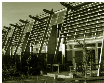
Figure 1 Great Bow Yard by Ecos Homes (formerly South West Eco-Homes) showing the fully glazed southern elevation

Note also the high level windows to help direct cool night over the exposed concrete ceiling.