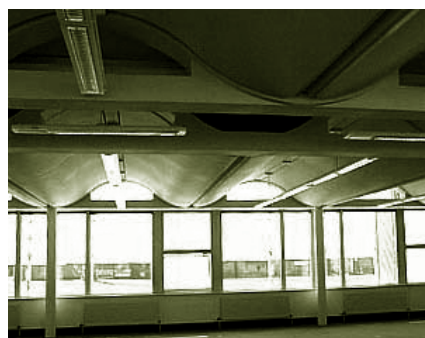
Figure 2 BRE Environmental Building