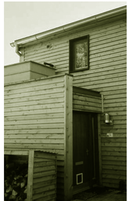
Figure 3 Rainwater harvesting

The rate of heat loss will always be dependent on the building's airtightness. A building with low u-value wall and roof construction but badly fitting windows or badly detailed junctions between, for example, walls and window casing, will not perform as well, simply because heat will be lost through excessive ventilation. The UK is full of old buildings that suffer from air-leakage and it is a key issue to be addressed when seeking to improve their energy efficiency. A client can achieve this by insisting on robust