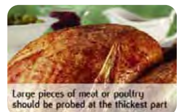
Large pieces of meat or poultry should be probed at the thickest part